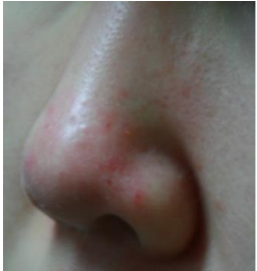
Before 3 rd Treatment