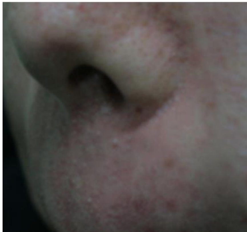
Before 4 th Treatment