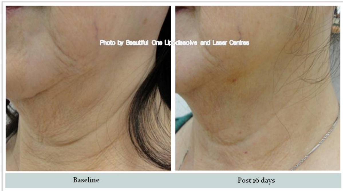
Fig.4. INTRAcel Results

Figure 4 is a case of the neck. It was my first trial to treat a neck, and I was very surprised to see the improvement by INTRAcel as shown in the picture. I would say based on my cases that there are more possibilities of treatment in other areas by FRM technology of INTRAcel.