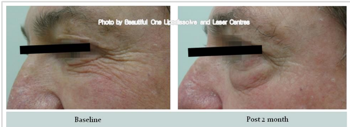
Figure 3. INTRAcel Results

Figure 3 is a case of male patient. His face became brighter and his wrinkles have been improved on post 2 month from the baseline.