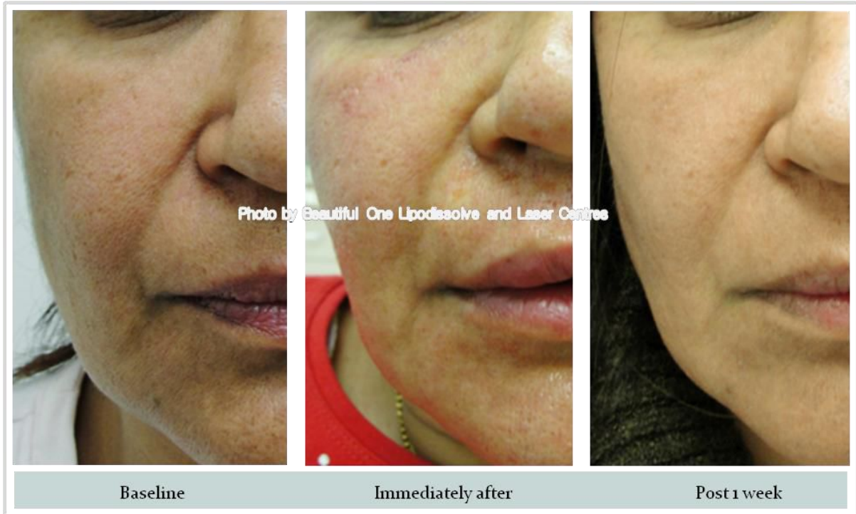
Figure 2. INTRAcel Results

Figure 3 is a case of male patient. His face became brighter and his wrinkles have been improved on post 2 month from the baseline.